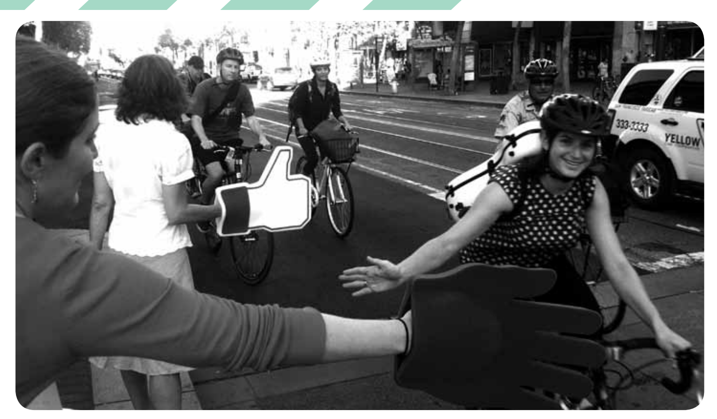
Volunteer Ambassadors build support for bikeways and smooth pavement and celebrate the improvements

So you began to hear about and get involved with Connecting the City: sending over 300 letters of support for Fell and Oak Street, filling out hundreds of surveys for potential Polk Street changes, attending dozens of community meetings for projects on JFK Drive, Cesar Chavez, Holloway and more.