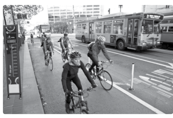
Imagine a Copenhagen-style bike counter on Market Street.

Up in the sky, it's a bird, it's a plane, it's a San Francisco Bicycle Coalition billboard! Four billboards featuring real San Francisco bike riders (and SF Bicycle Coalition