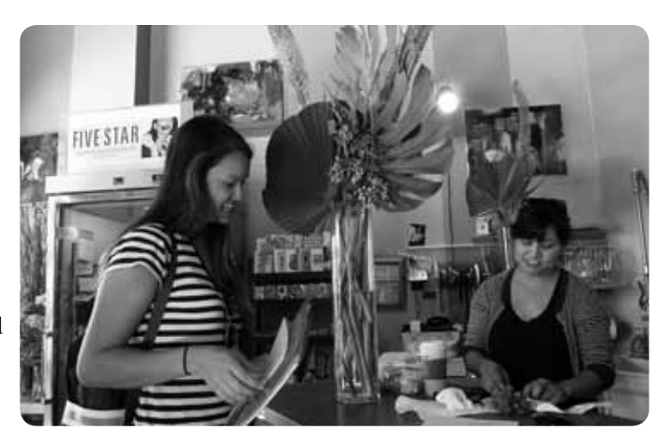
Building business support for Fell and Oak safety improvements.

If you can't volunteer, then please ask at least one friend in the next week to join the SF Bicycle Coalition. We are our