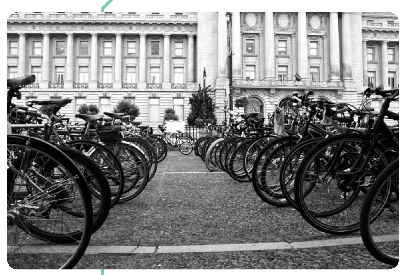
We have a long history of rallying our members and advocating for change in City Hall.

Green waves, green sharrows, and green separated bikeways start with you. Whether it is at community meetings for 2nd Street, Polk Street or Market Street or on a Love Your Lanes ride in your neighborhood, we're excited to see you in 2013 and work together to Connect Our City.