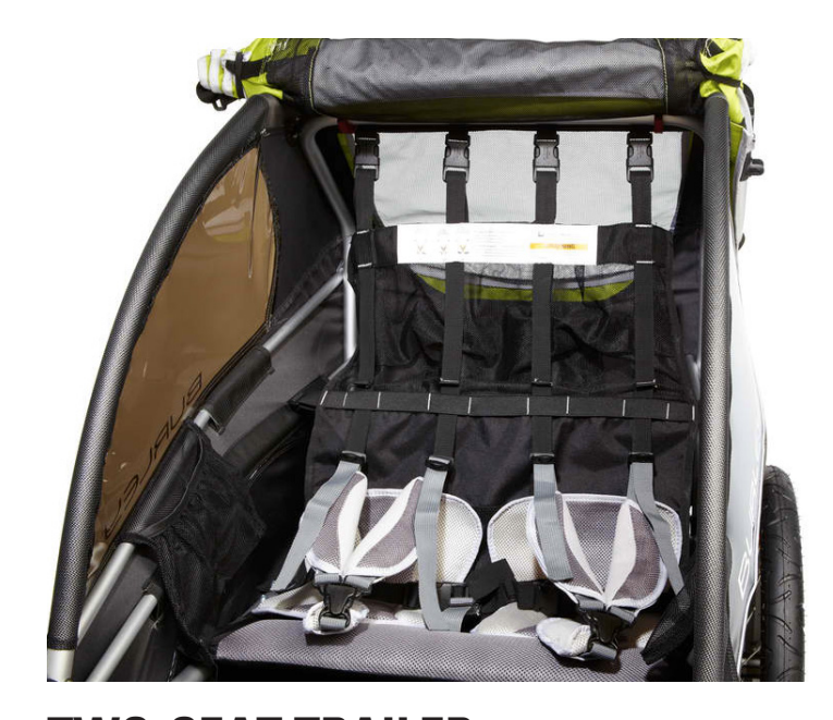
TWO-SEAT TRAILER $70-$700