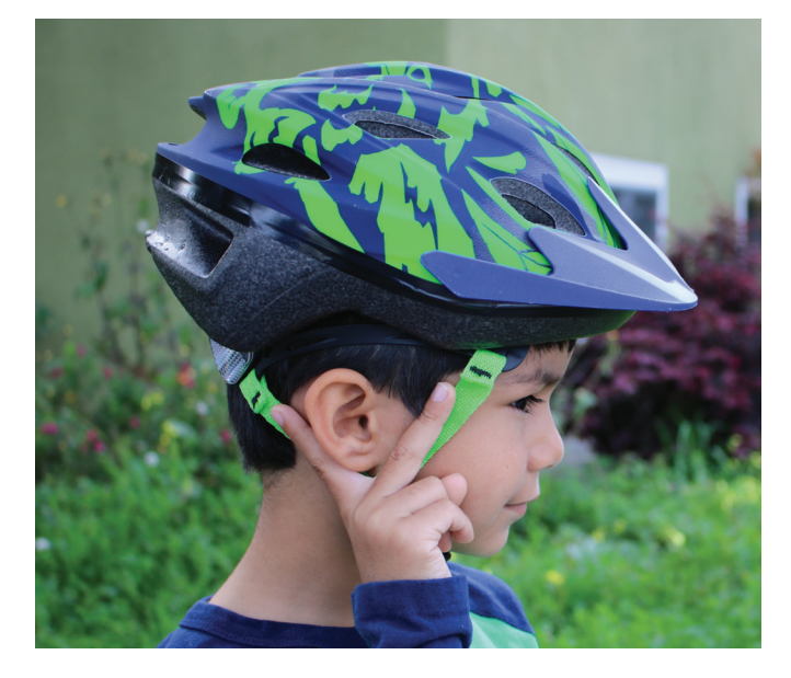
The straps should make a V below your ears.