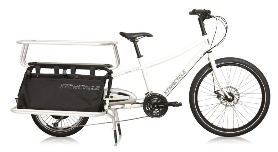
MID/LONG TAIL BIKE $2000-$4500