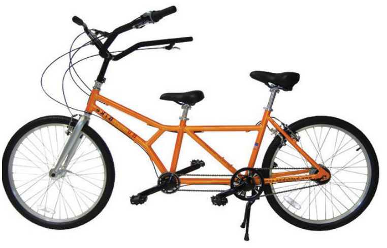
TANDEM BIKE $200-$2000