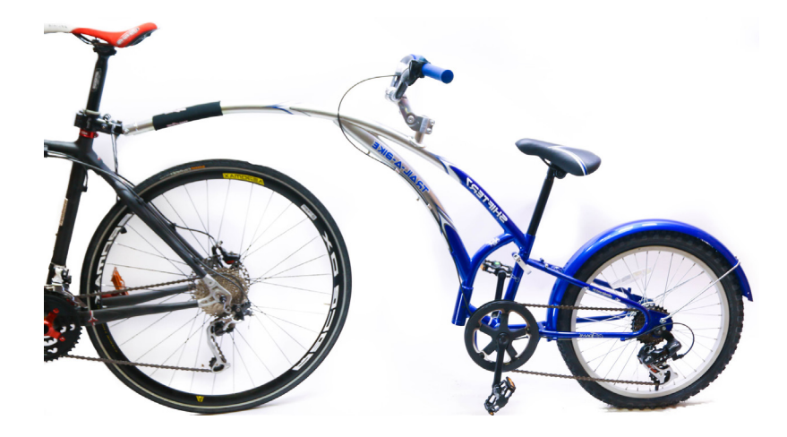
TRAILER BIKE $150-$300

Attatches your bike to your child's bike $50-$80