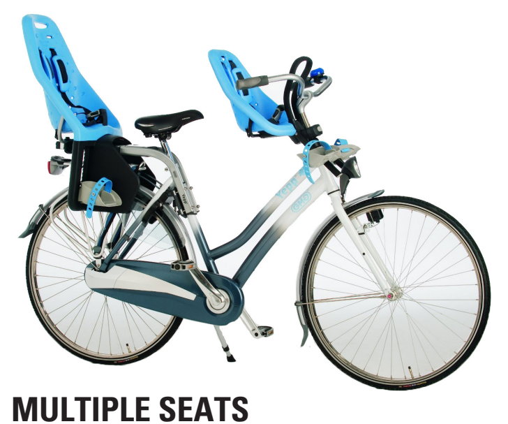
$40-$200 per seat