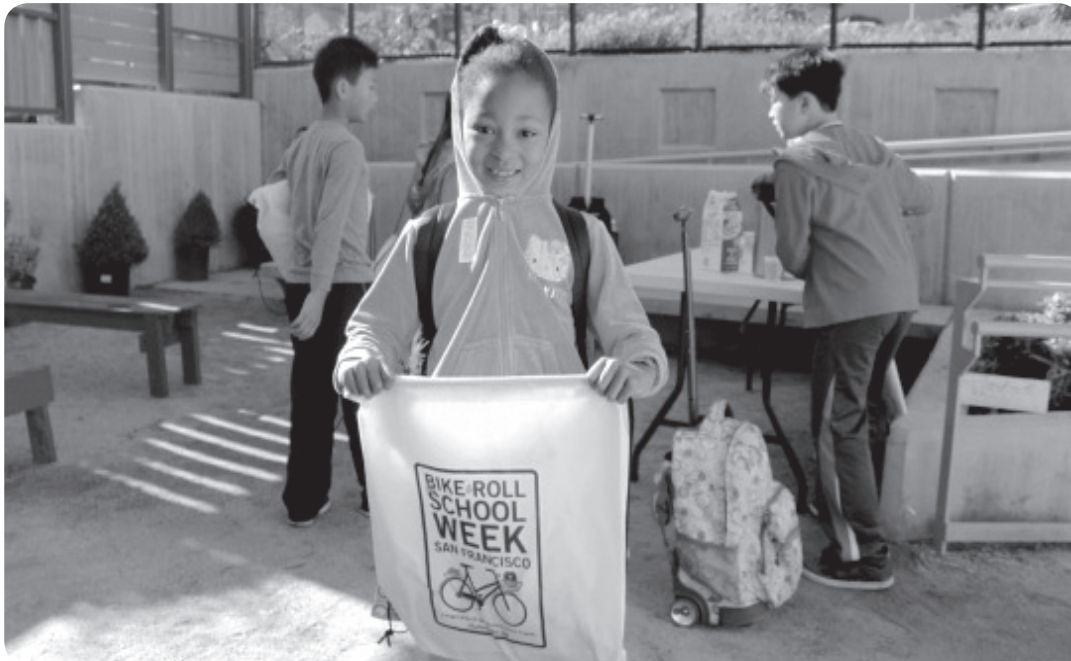
Sign up your school for Bike & Roll to School week this year!