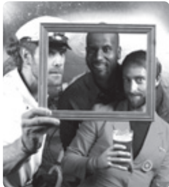
Over 1,000 members celebrated with us at Winterfest this year!

Our quarterly newsletter – originally called the Tubular Times (in true 90's style) – launched in October 1990. As we prepared for this 150th throwback edition of the Tube Times , we've been quite nostalgic looking back at Issue #1. In it, we called for bicycle access for parts of the Bay Area Ridge Trail, for a Saturday auto-free JFK Drive, for a car-free Market Street and more. We're excited to keep you updated with the Tube Times for years to come!