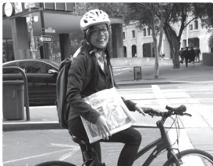
Bike to Work Day is a great day to get rolling!