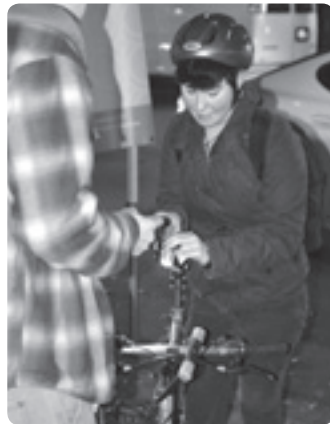
Our volunteers installed 1,000 lights!