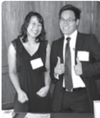
Our interns keep our wheels rolling!

We are training thousands of drivers how to safely share our city streets with people biking, including 1,000 taxi drivers. In 2014 we expanded our reach by partnering with Recology, Google, and Genentech for training on right turns and bike lanes, loading