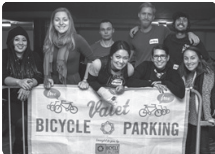
In 2014, our Valet Bicycle Parking program parked over 17,000 bikes!

As days got shorter after Daylight Saving Time, we partnered with the San Francisco Municipal Transportation Agency to distribute over 1,000 bike lights to those riding lightless at night. Through our annual Light up the Night campaign, more than 60 fantastic volunteers and staff installed lights at pop-up distribution stations in