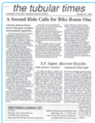
Tubular Times, Issue 1, October 27, 1990