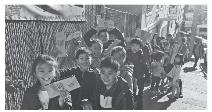
Gordon Lau students celebrating Bike & Roll to School Week.