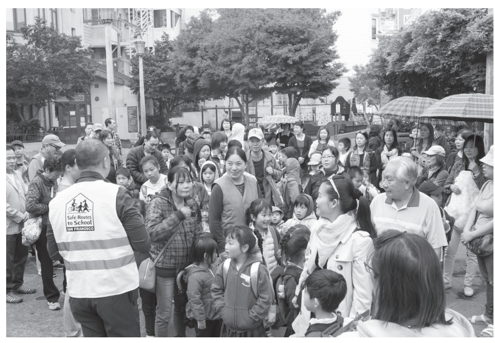
Participants gathering for a walking school bus to Jean Parker Elementary in Chinatown.

In our new Strategic Plan, we embrace the value of transportation justice and promise to advocate for everyone's equitable access to safe, affordable and healthy transportation. To achieve those goals, we're upping our game when it comes to multilingual and culturally competent engagement.