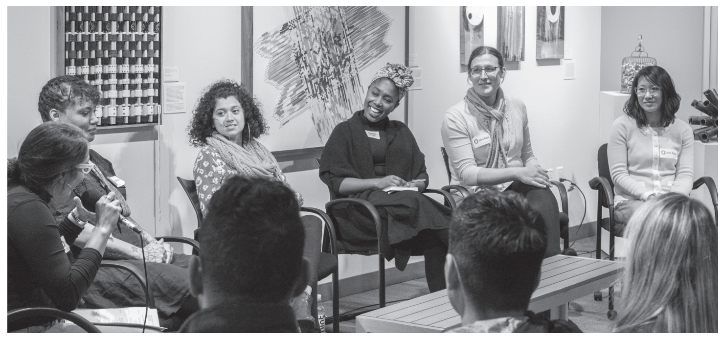
Our recent panel on intersectional feminism and biking featured panelists challenging the audience and each to recognize the complex diversity of experiences people have both on and off of their bikes.