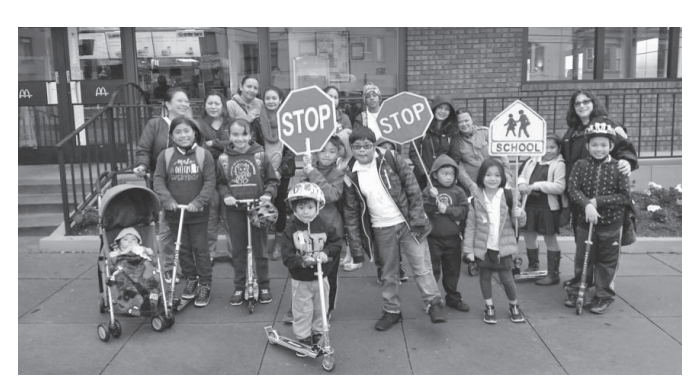
Longfellow students enjoying Bike & Roll to School Week.