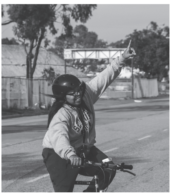
Community Bike Build participant enjoying her new ride on the streets of Bayview-Hunters Point.